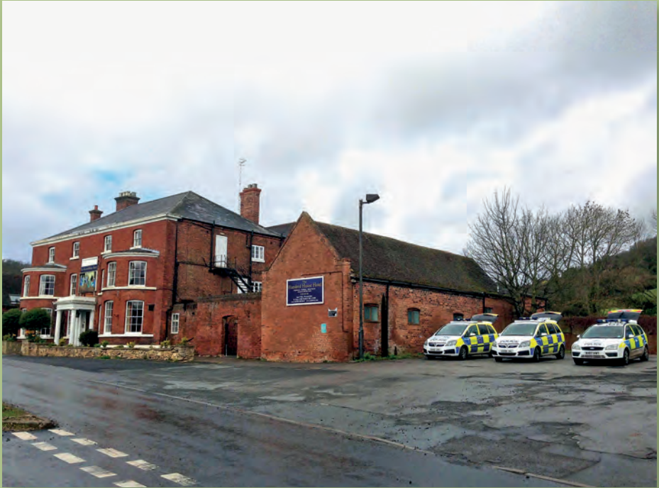
Police move into The Hundred House