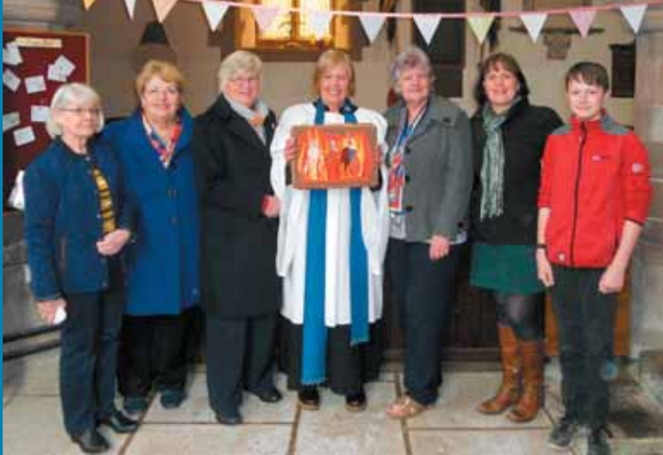
Locals gather to dedicate a memorial kneeler at St Kenelm's, Clifton

Clifton upon Teme • The Shelsleys • Lower Sapey