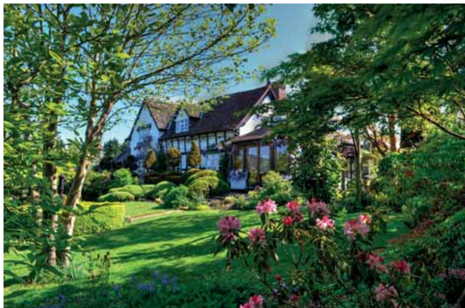
GARDENS OF WICHENFORD: Open as part of the Gardens of Wichenford open weekend on 8-9 June (see full report on page 13) is Pear Tree Cottage in Witton Hill. Pictured top: The Grade II listed black-and-white cottage (not open) viewed from the woodland border. Bottom: The garden's picturesque pond.