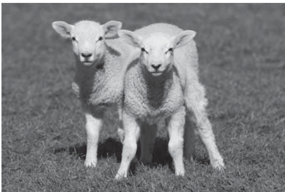
Twin spring lambs pictured near Shelsley Beauchamp