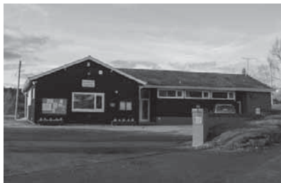
Shelsleys' Village Hall. The Social Club entrance is on the right

"We'd love even more locals to come along and make the most of our facilities. Drinks are well below city centre prices, there's a TV to watch sports and news in the bar, and nothing beats the view from our patio on warmer evenings. We're also dog-friendly for walkers and close to the Worcestershire Way. Everyone is welcome to try it out before they join."