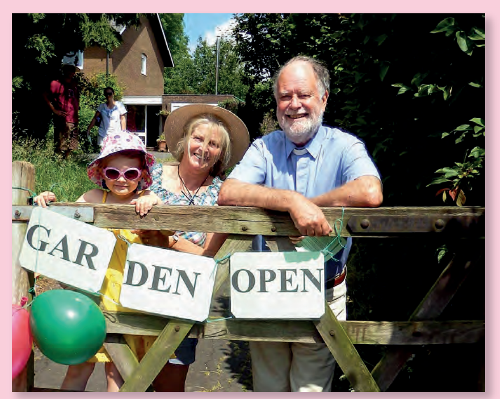
Clifton Open Gardens Weekend