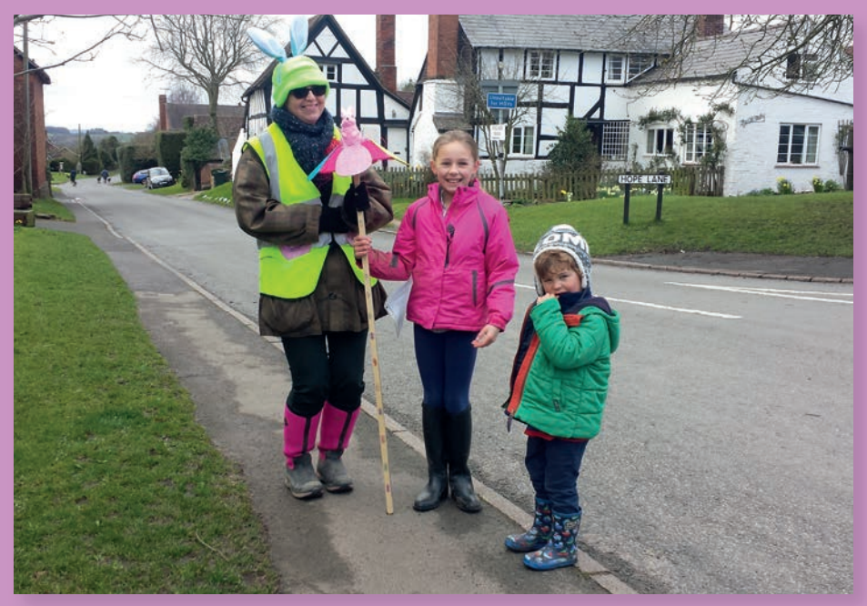
Clifton Easter Egg Trail