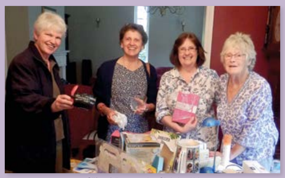
Clifton folk supporting Christian Aid

Clifton upon Teme • The Shelsleys • Lower Sapey