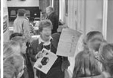
Pupils from Clifton School were given a first hand lesson in democracy when they visited the Polling Station in the village last month.