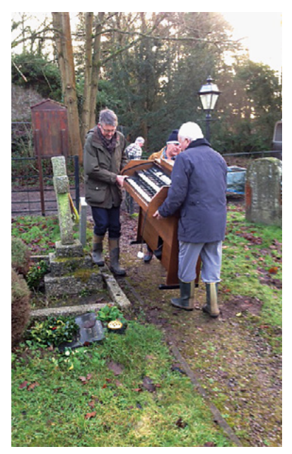
The new organ being carried into St Barhtolomew's church in Harpley