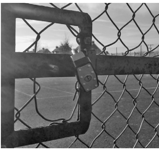
The padlocked entrance to the tennis courts.

In a letter to the Tennis Club, the Parish Council said it would 'assume responsibility for the tennis courts and close them to all users until further notice'. In addition, the club's 'user/hire rights' have been revoked and the Parish Council expressed 'disappointment about the lack of maintenance which had resulted in the deterioration of a community asset under the Tennis Club's stewardship'.