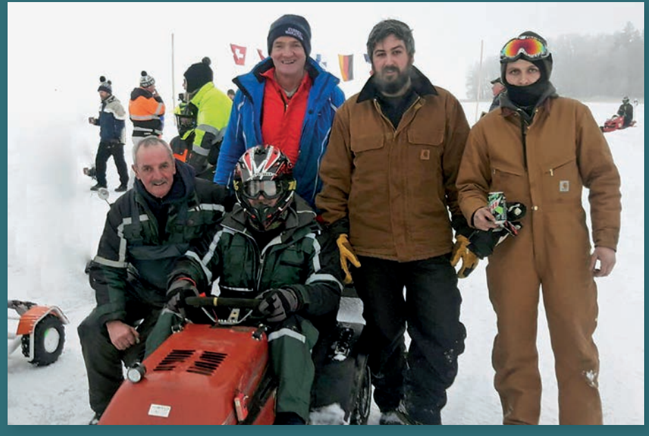
Lawn mower racing in Finland