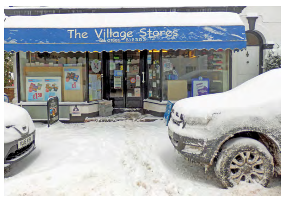
Clifton Village Stores open for business in all weather. Local farmers worked round the clock to keep the lanes open (below)