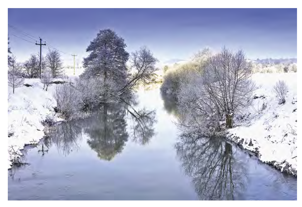
View from New Mill Bridge, Shelsley Beauchamp.

Sheep near Homme Castle Farm, Shelsley Beauchamp