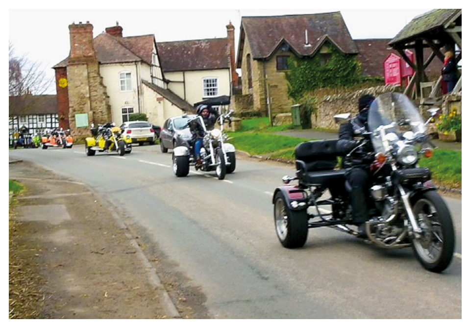
An impressive motorcycle rally rode through Clifton on 1st April

GUEST EDITOR: Michelle Whitefoot editortement