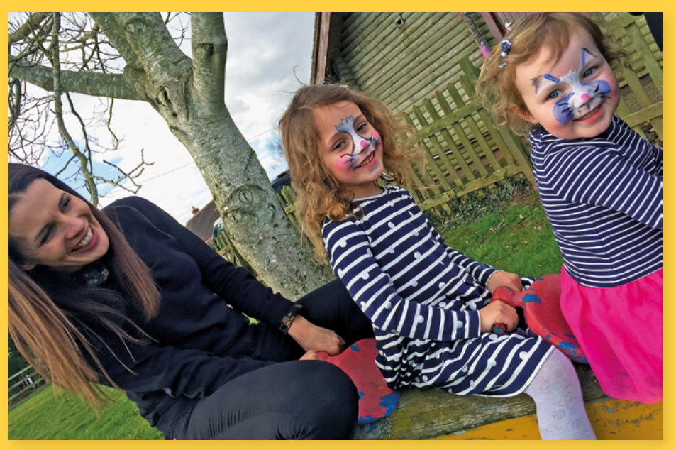
Fun at Clifton Early Years Centre's Easter Egg trail

Clifton upon Teme • The Shelsleys • Lower Sapey