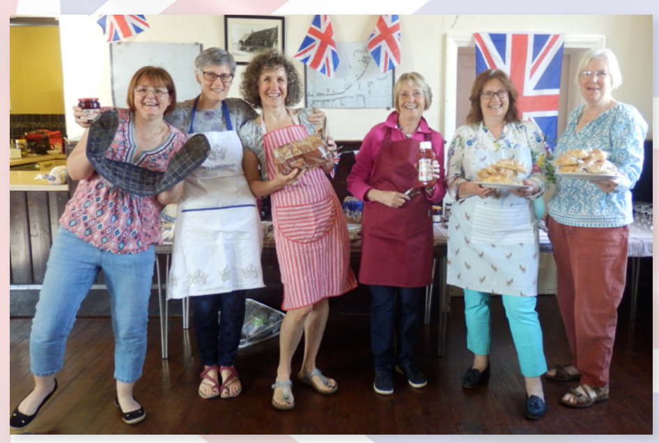
The Royal Wedding Big Breakfast team in Clifton

Clifton upon Teme • The Shelsleys • Lower Sapey