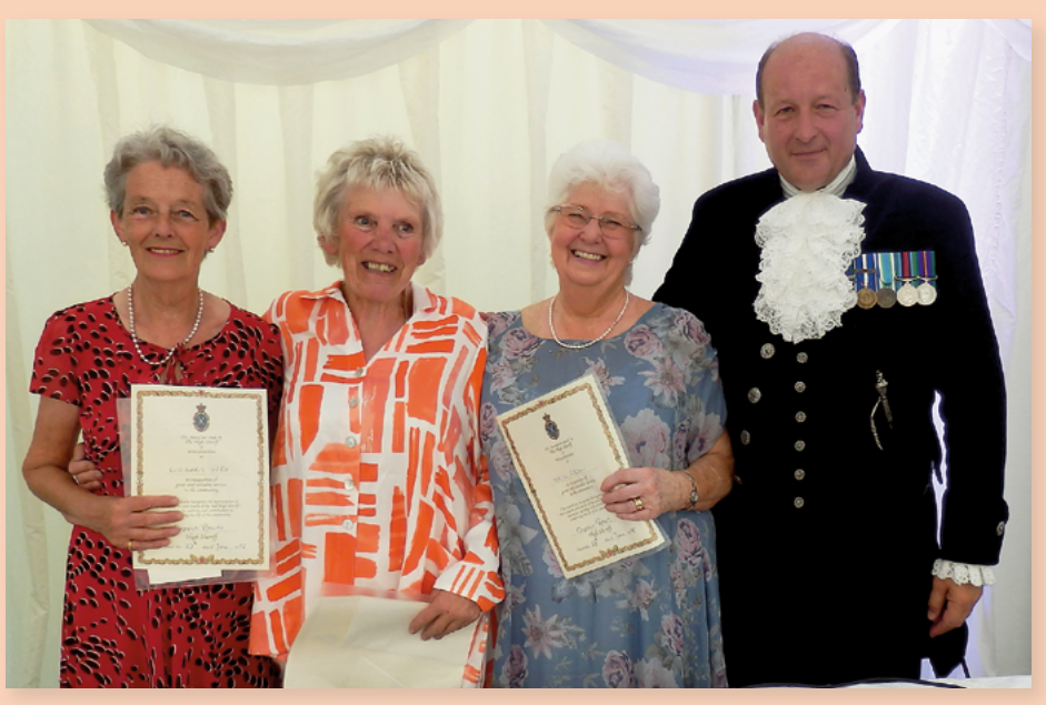
High Sheriff's Awards for Service to the Community

Clifton upon Teme • The Shelsleys • Lower Sapey