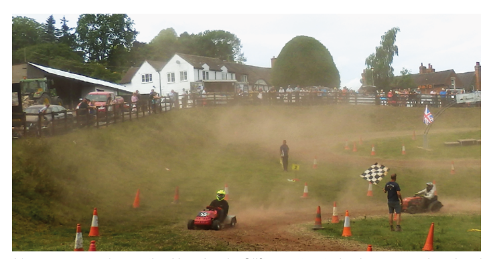
Lion mower racing at the New Inn in Clifton, attracted a large crowd as local competitors battled it out in a series of races