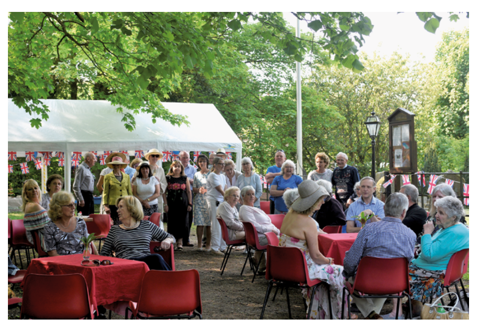
Harpley residents celebrate the Royal Wedding