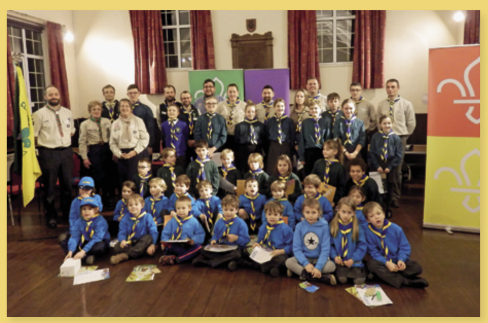
Clifton Scouts. Cubs and Beavers

Clifton upon Teme • The Shelsleys • Lower Sapey