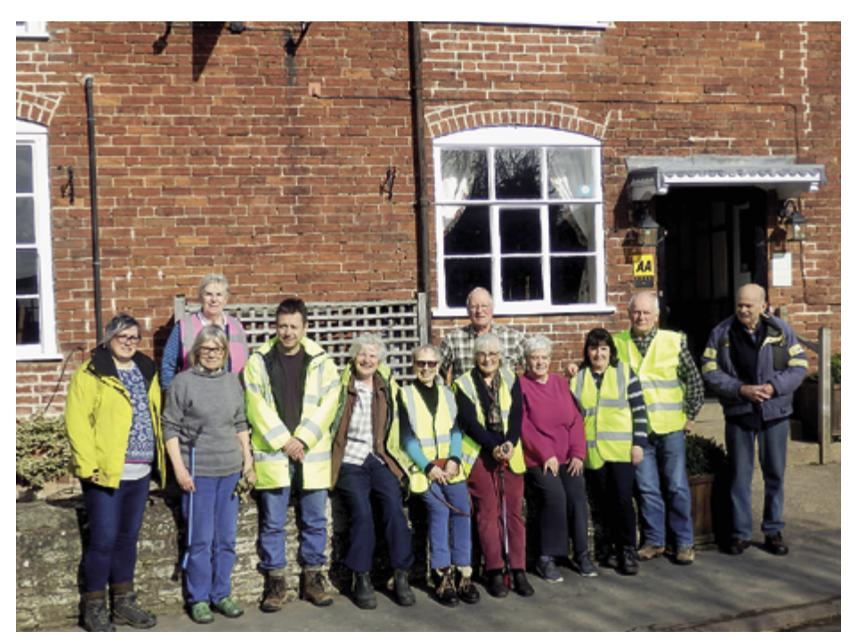
Local residents from Clifton, Harpley and Lower Sapey pictured outside the Lion Inn at the end of a busy morning's litter picking patrol in the area.