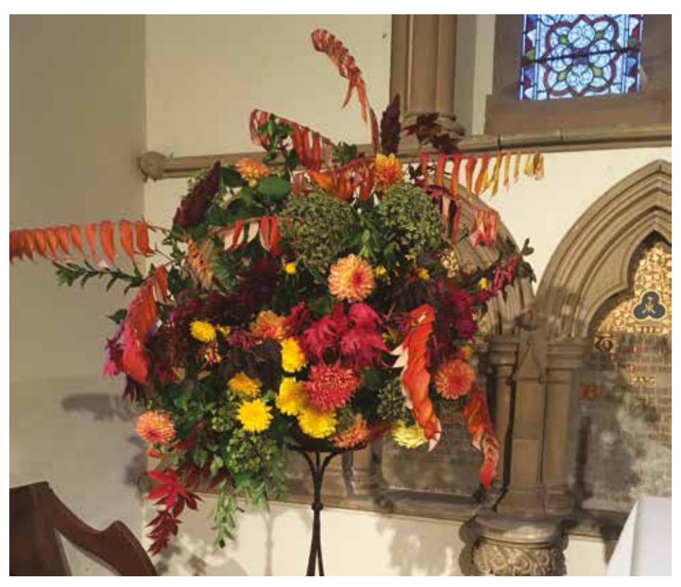
One of the magnificent flower displays created for the Harvest Service at All Saints Church, Shelsley Beauchamp on Sunday 18 October (Full story on page 13).

Main Editor mailbox: EDITOR THIS ISSUE / SHELSLEYS NEWS