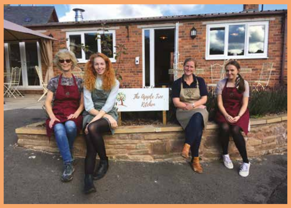
Pitlands Farm opens The Apple Tree Kitchen

Clifton upon Teme • The Shelsleys • Lower Sapey