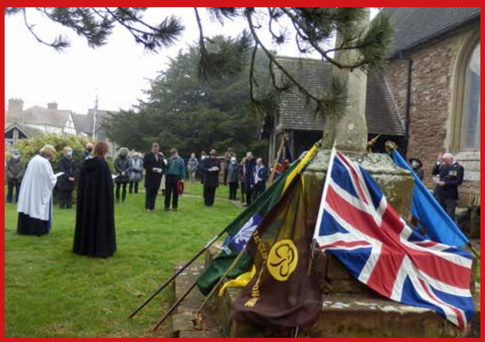
Clifton remembers those who fell in battle

Clifton upon Teme • The Shelsleys • Lower Sapey