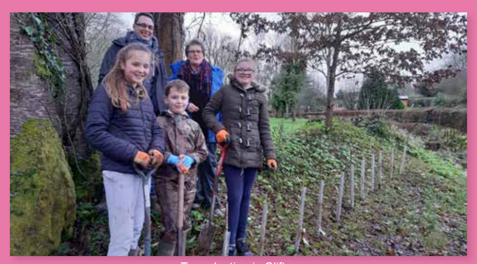
Tree planting in Clifton

Clifton upon Teme • The Shelsleys • Lower Sapey