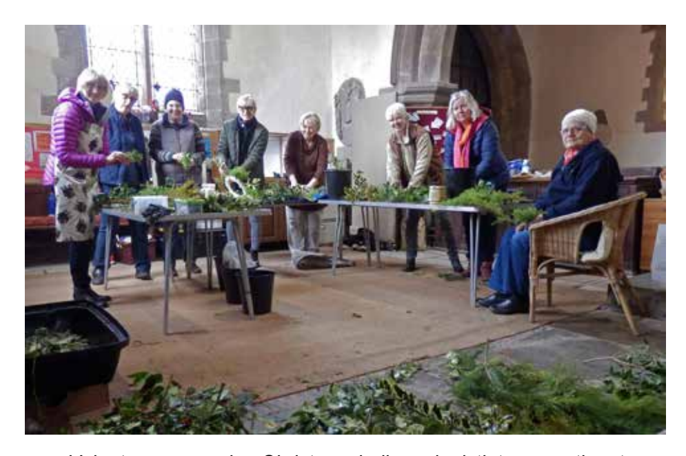
Volunteers perparing Christmas holly and mistletoe wreaths at St Kenelm's Church, Clifton