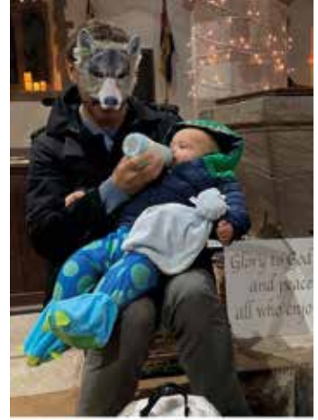
Halloween Light Party held in St Kenelm's Church