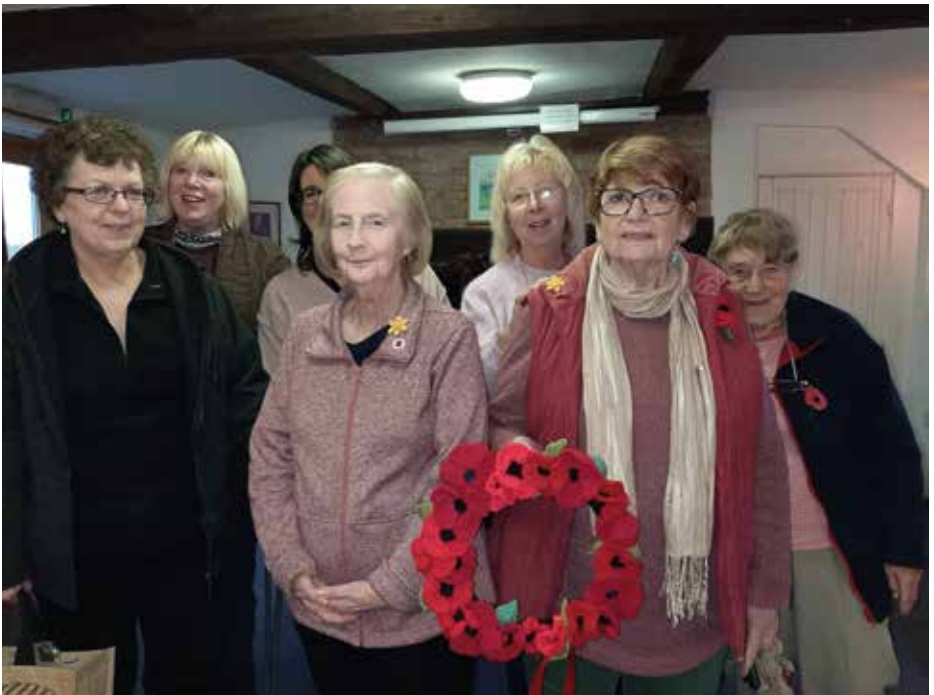
Members of the Clifton Crafters with their knitted poppy wreath