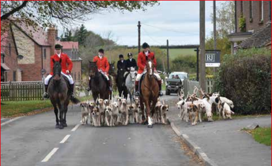
Clifton on Teme Hunt

Clifton upon Teme • The Shelsleys • Lower Sapey