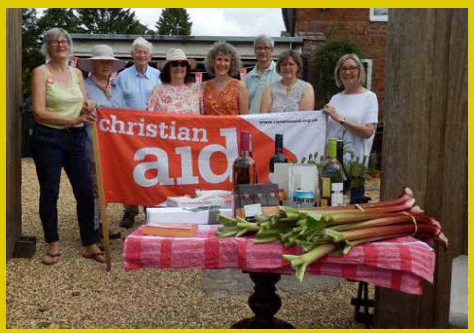
Fundraising for Christian Aid in Clifton

Clifton upon Teme • The Shelsleys • Lower Sapey