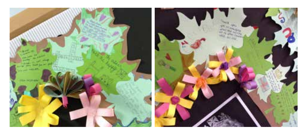
Above: Corgis, crowns and castles – Some of the drawings and written tributes created by children at Clifton Primary School, reflecting on HM The Queen (story on page 17).