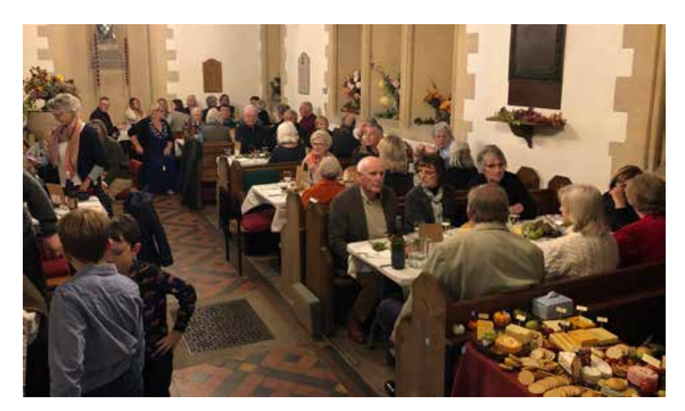
Last month's Harvest Supper at St Bartholomew's Church in Harpley raised over £1,000 towards the cost of installing new toilet facilities in the building.