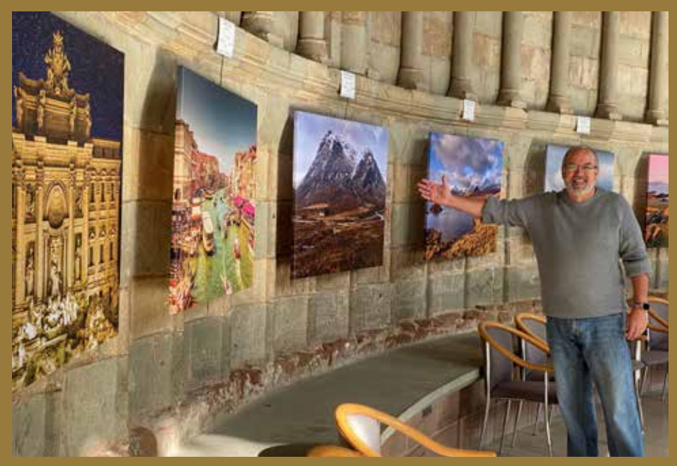
Shelsleys Photographer's Cathedral Exhibition

Clifton upon Teme • The Shelsleys • Lower Sapey