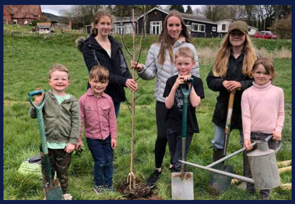
Planting the 7 Platinum Jubilee Trees in The Shelsley's

Clifton upon Teme • The Shelsleys • Lower Sapey