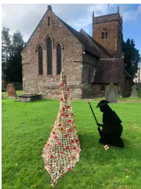
Beautiful All Saint's - We will remember them.