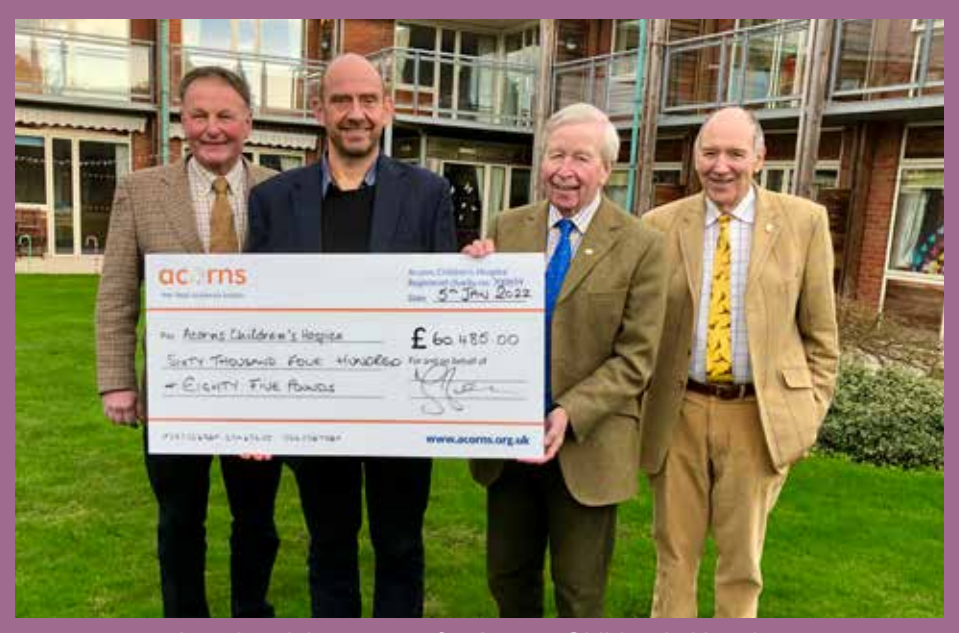
Locals raising money for Acorns Children's Hospice

Clifton upon Teme • The Shelsleys • Lower Sapey