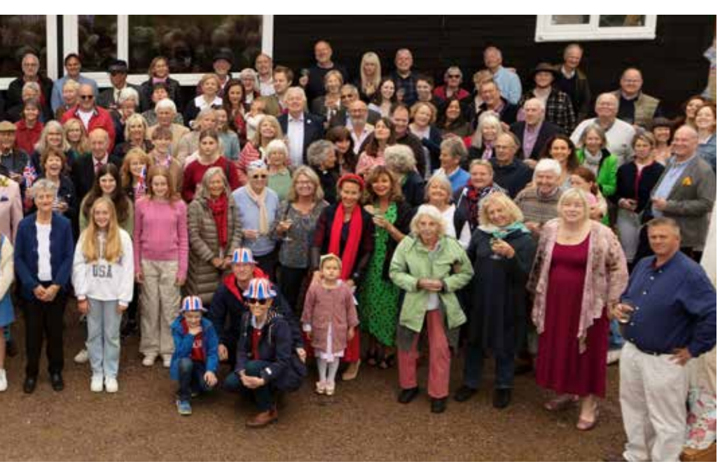
ve Platinum Jubilee photo outside the Village Hall