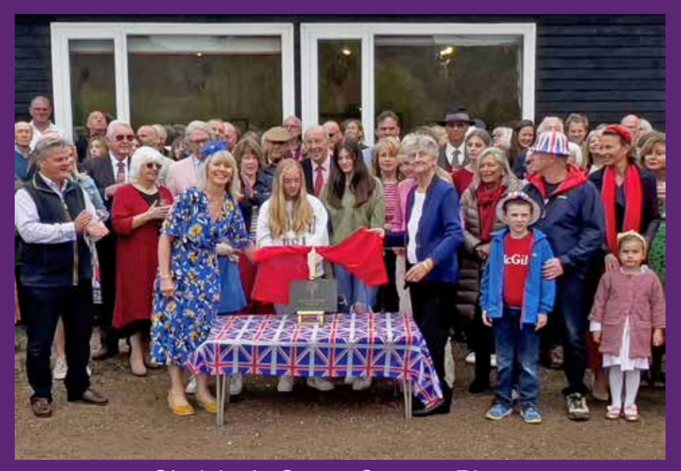
Shelsley's Green Canopy Plaque

Clifton upon Teme • The Shelsleys • Lower Sapey