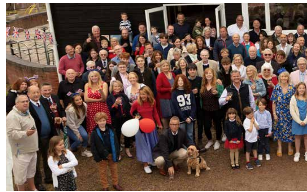
Nearly 200 residents from across the Shelsleys gathered for a commemorati