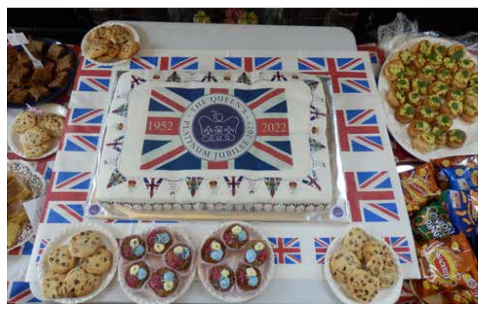
The Platinum Jubilee cake created by Clifton WI