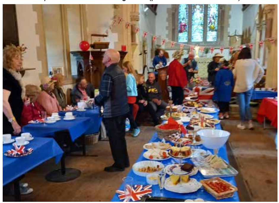
Jubilee celebrations in Harpley Church