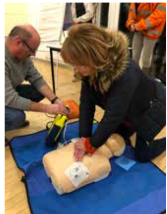
Local residents practising compressions.