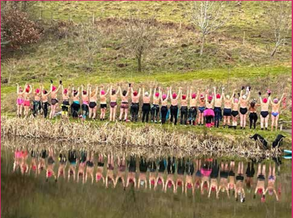
'Tits to the Wind' charity fundraising swim!

Clifton upon Teme • The Shelsleys • Lower Sapey