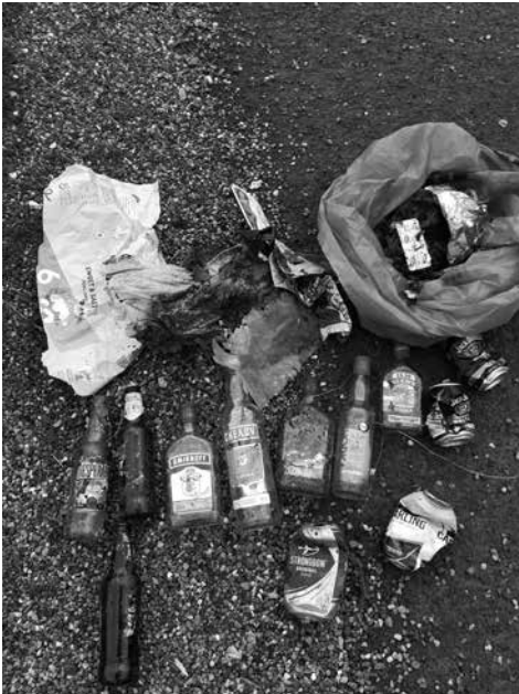
Early pickings on Kingswood Lane - who is drinking all this vodka?!

Thanks also to any of you who also pick up when you are out walking. It makes such a difference to our beautiful valley.