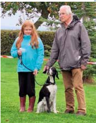
Below: The Finnegans & Rosie