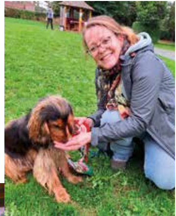
Right: Best in Show Winner