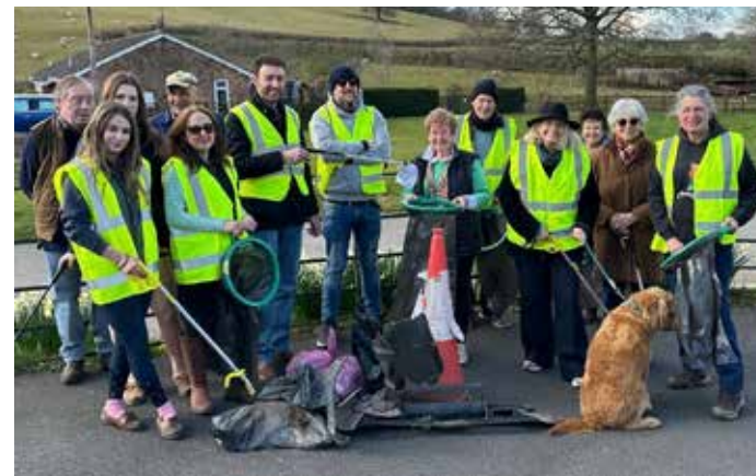
Pictured: Dame Harriett Baldwin MP (4 th from right) with Eastham's litter pickers.

As well as encouraging other local community groups to get together to help keep the countryside clean, she also urged drivers to take their rubbish home.