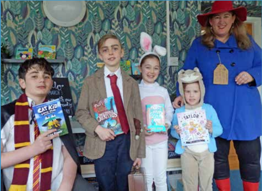
An array of favourite characters at Clifton Primary School's World Book Day

Clifton-upon-Teme • The Shelsleys • Lower Sapey