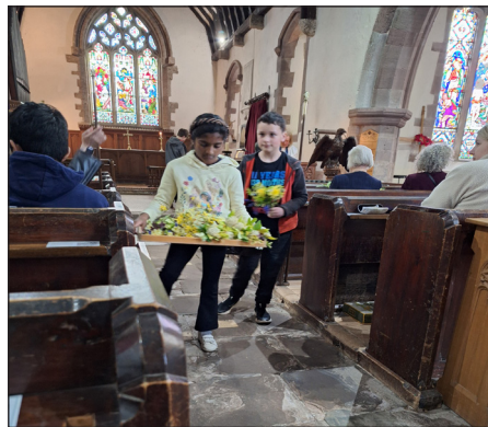
Children with flowers at the Clifton Mothering Sunday service.