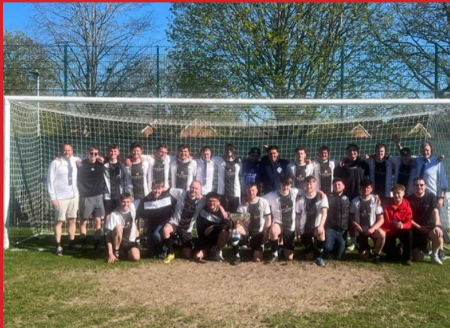
The triumphant Clifton Rovers football team

Clifton-upon-Teme • The Shelsleys • Lower Sapey