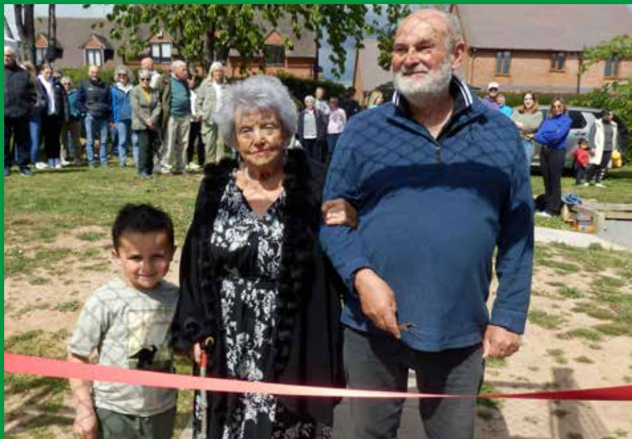
Official opening of the Clifton Recreation Ground

Clifton-upon-Teme • The Shelsleys • Lower Sapey