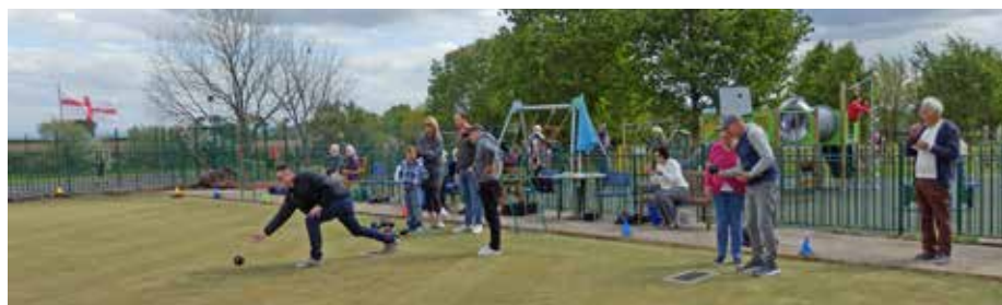
Clifton residents try their hand at bowling on the bowling green.